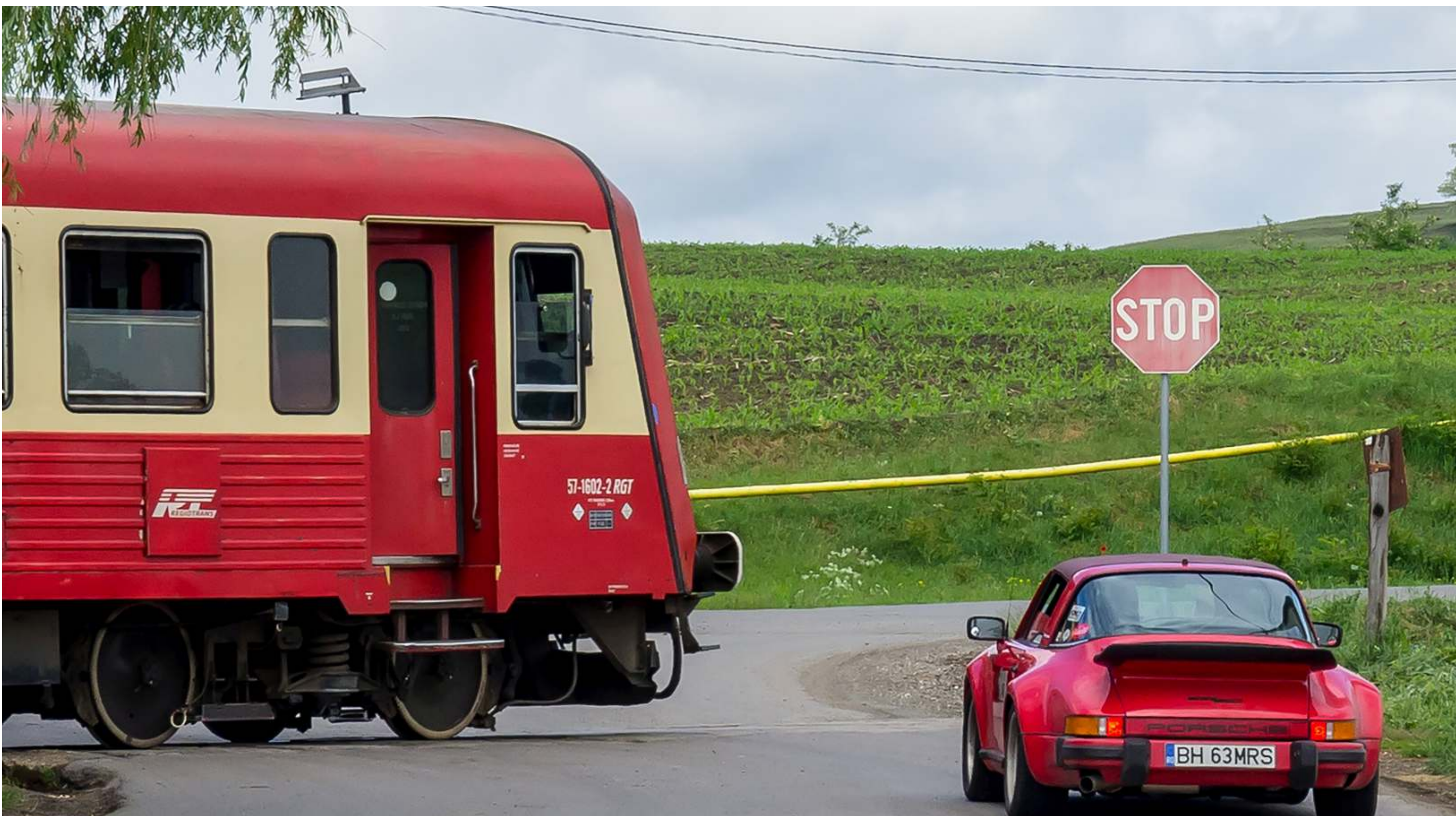
Porsche 911 SC - 1972