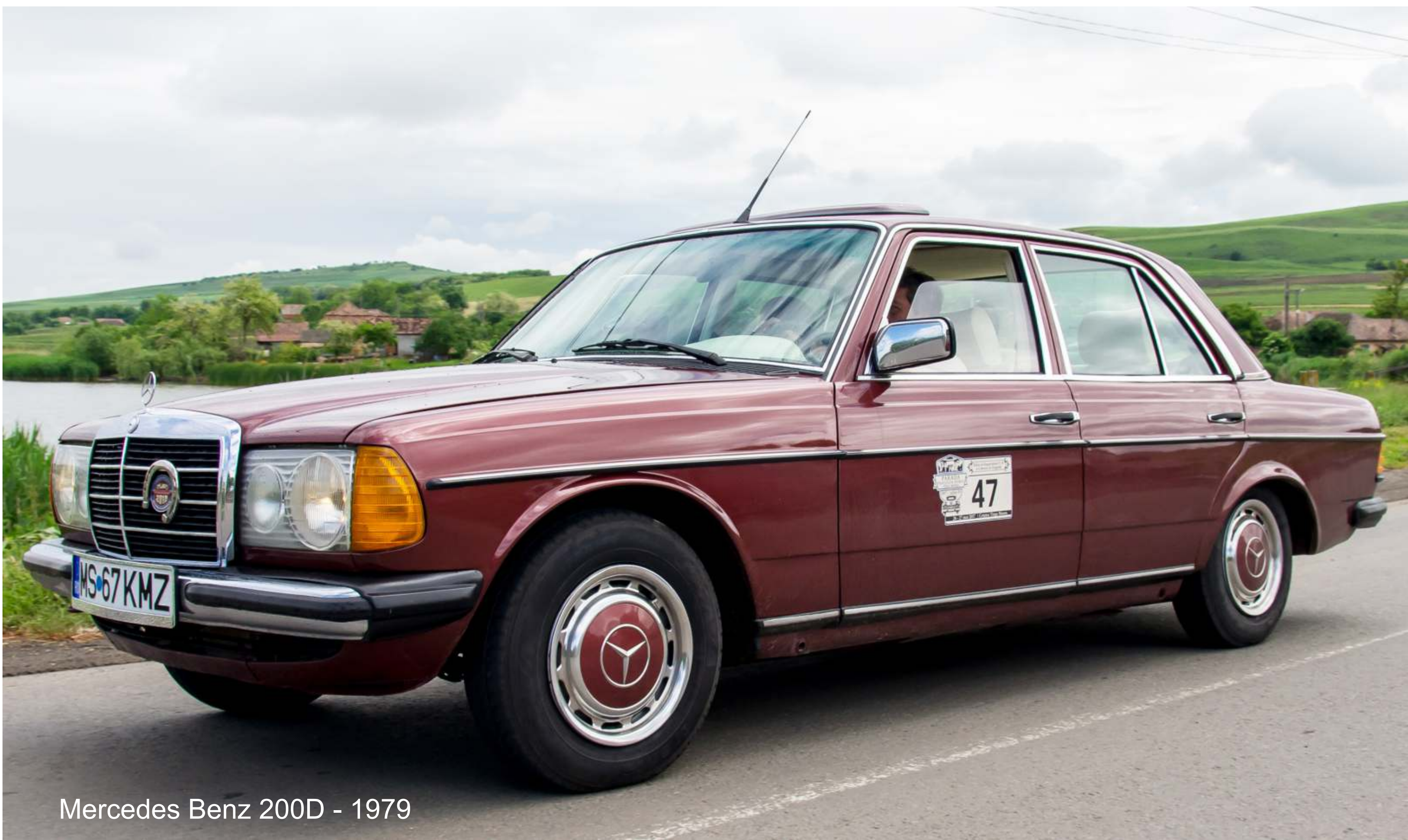
Mercedes Benz 200D - 1979