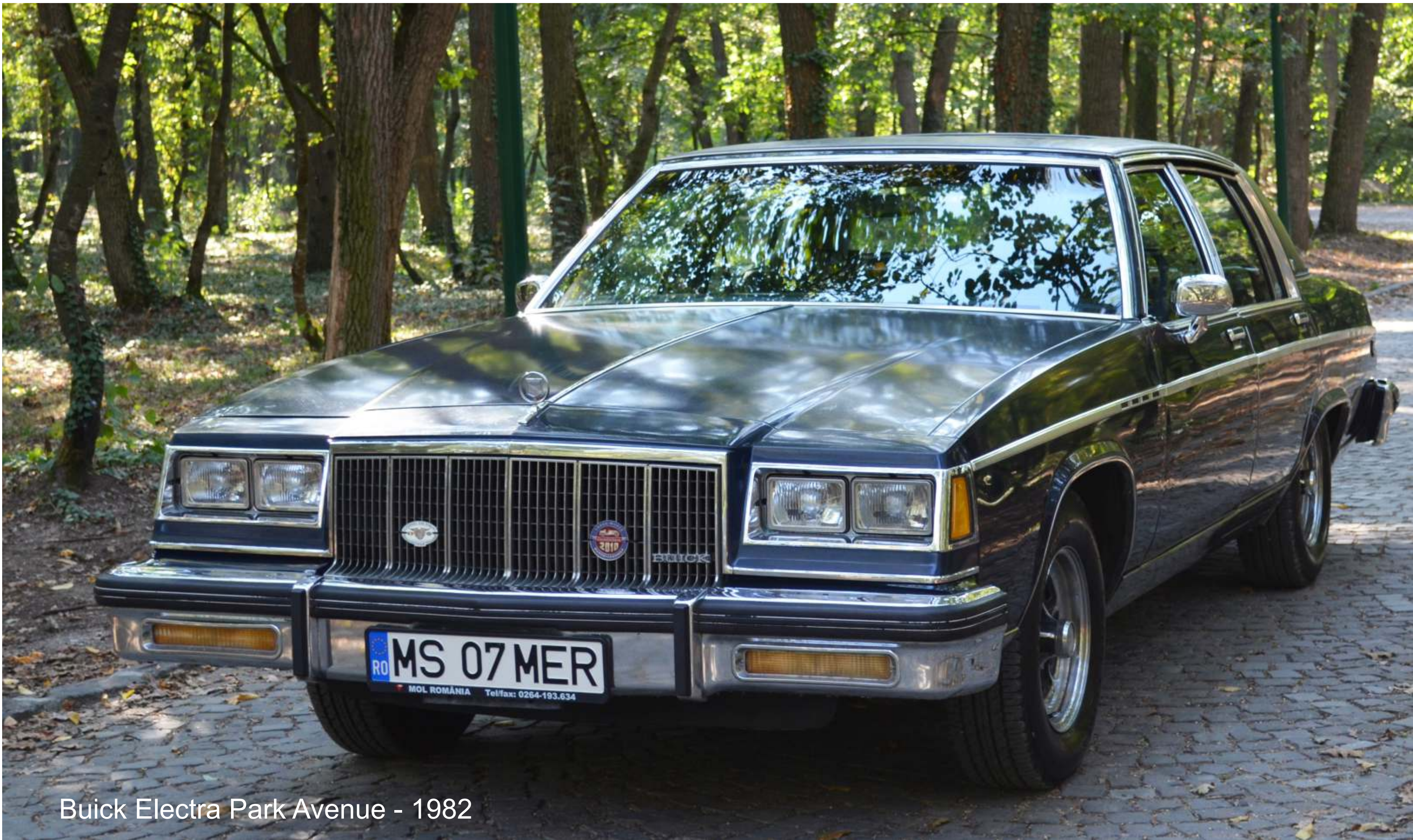
Buick Electra Park Avenue - 1982