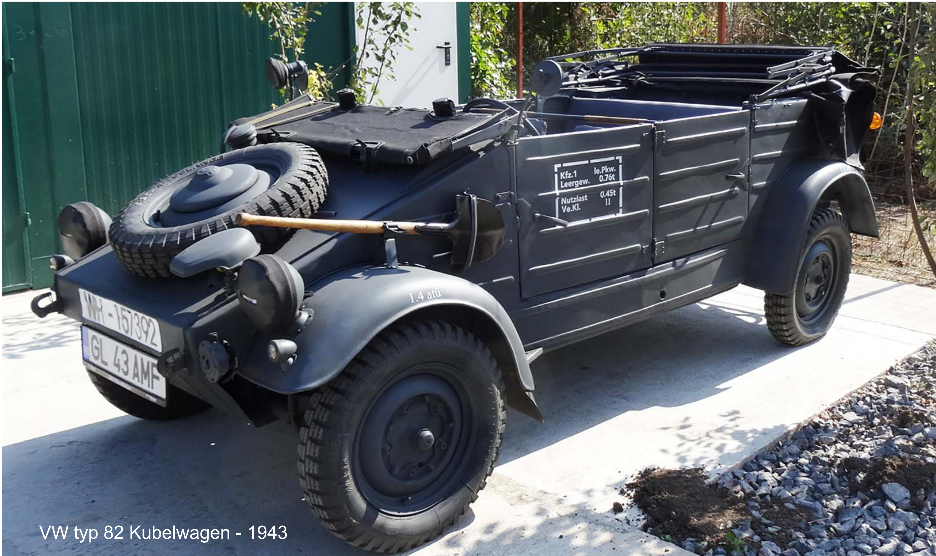
VW typ 82 Kubelwagen - 1943