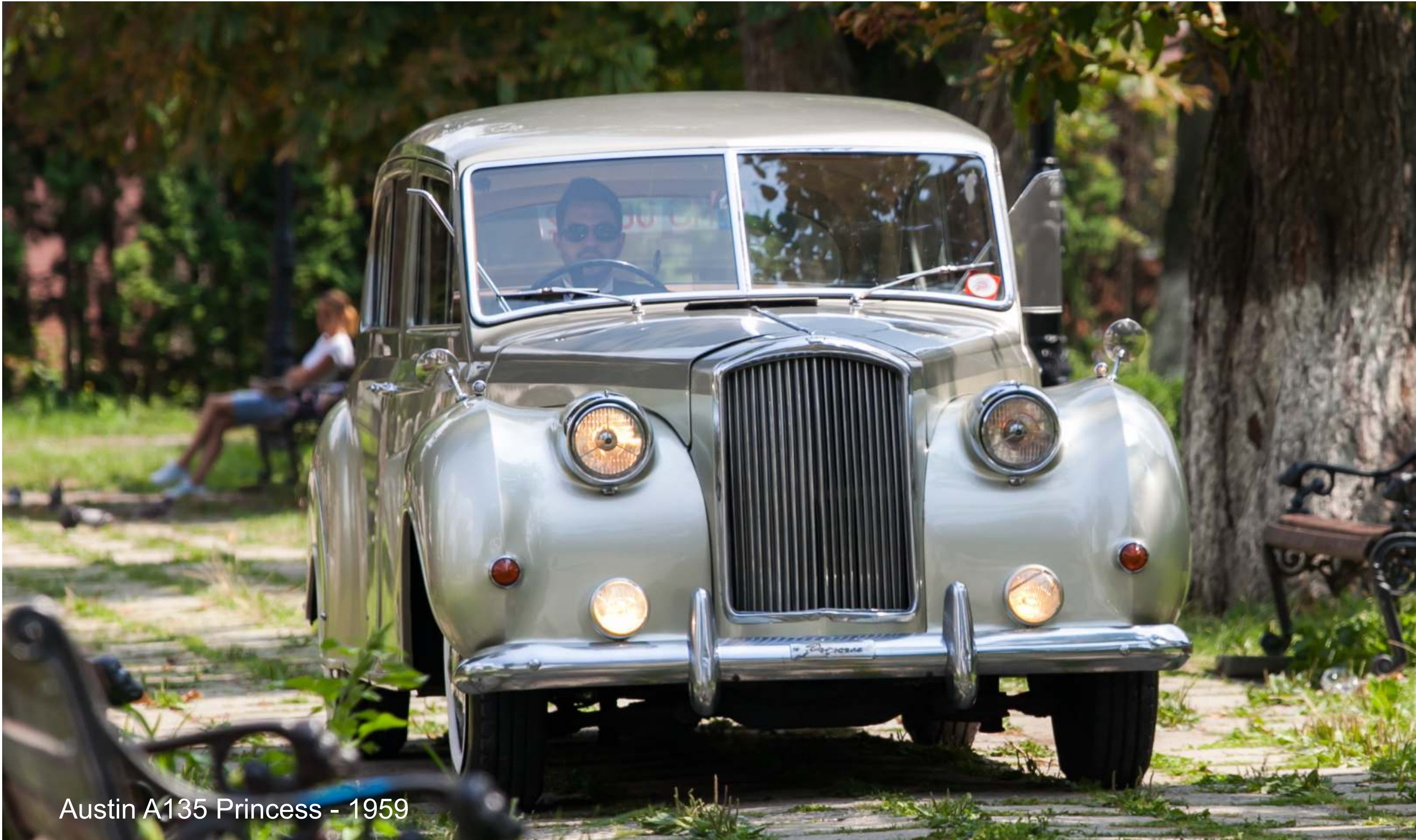
Austin A135 Princess - 1959