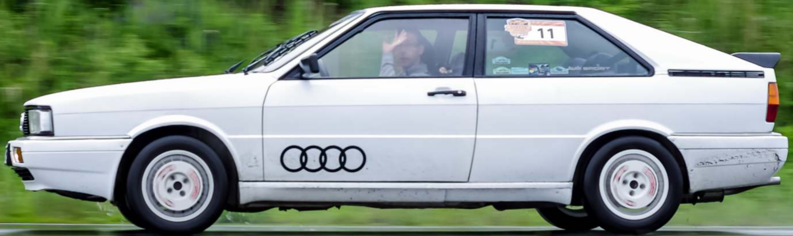
Audi 80 Coupe - 1986