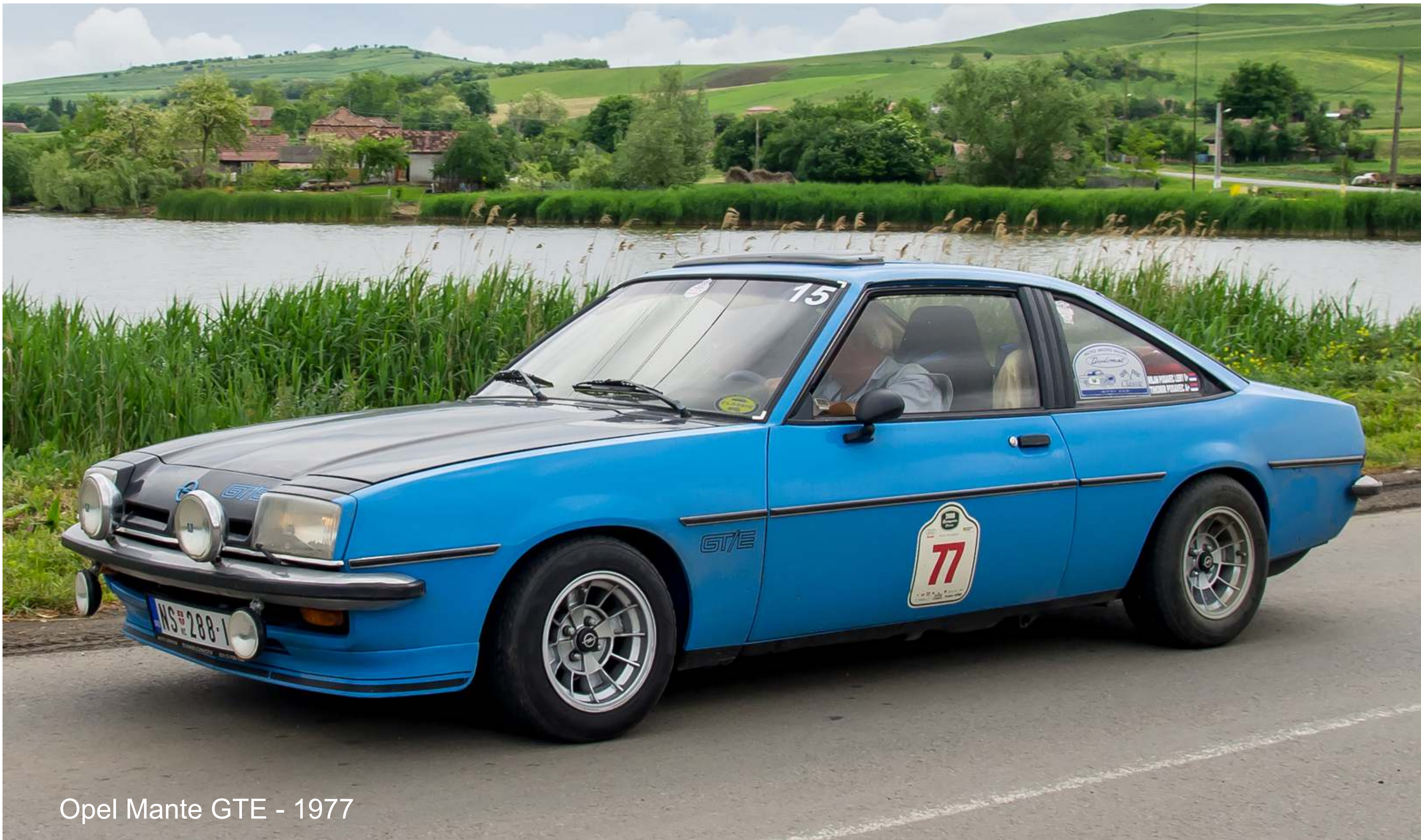
Opel Mante GTE - 1977