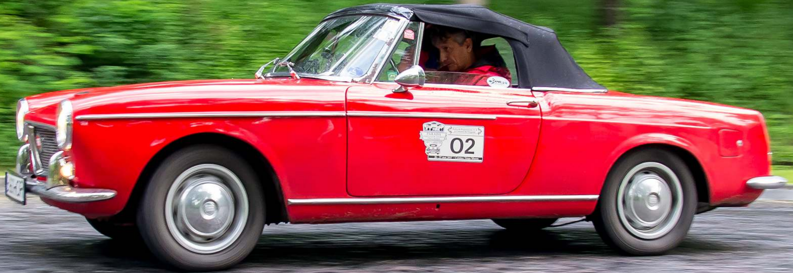
Fiat 1200 Spider - 1961