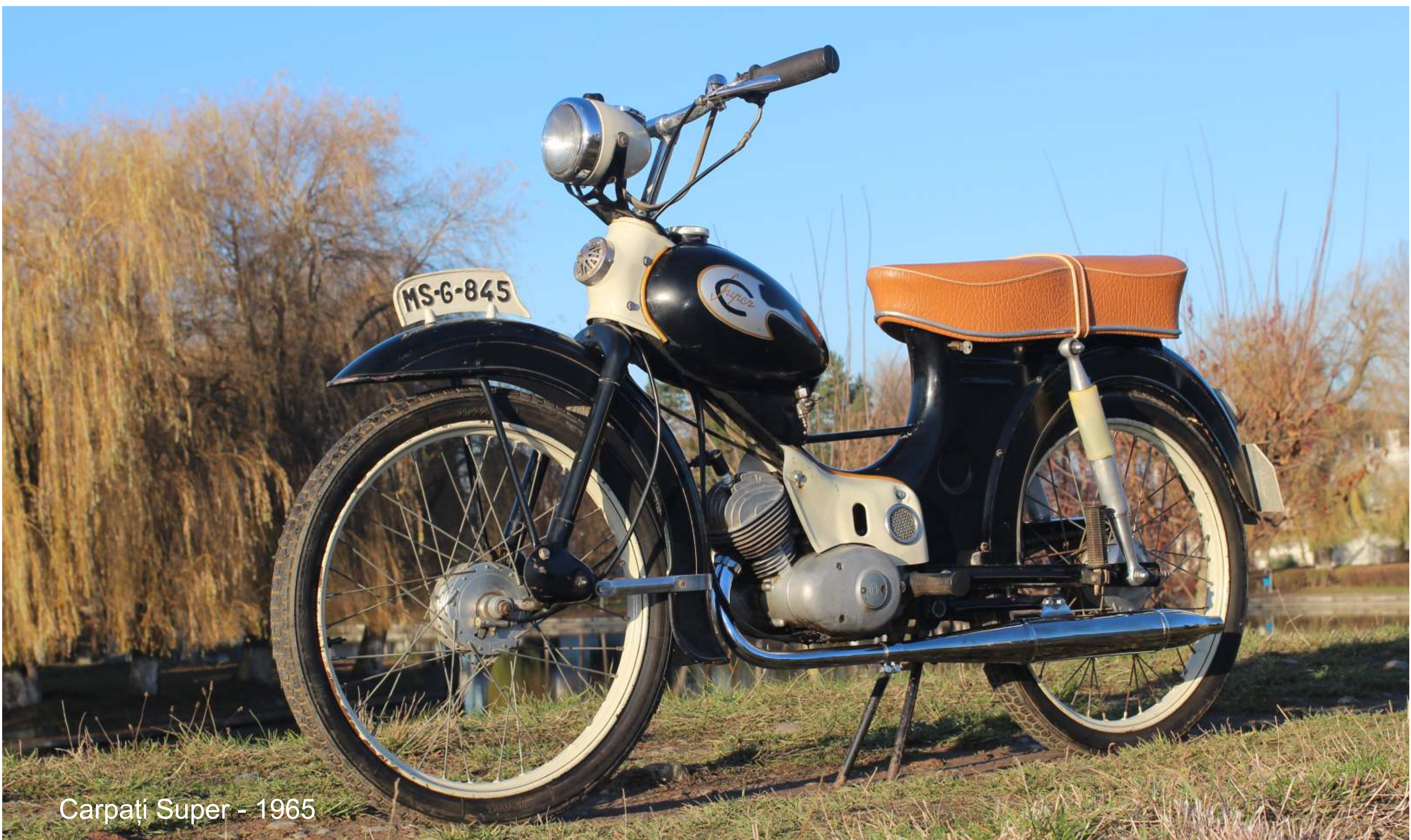
Carpați Super - 1965