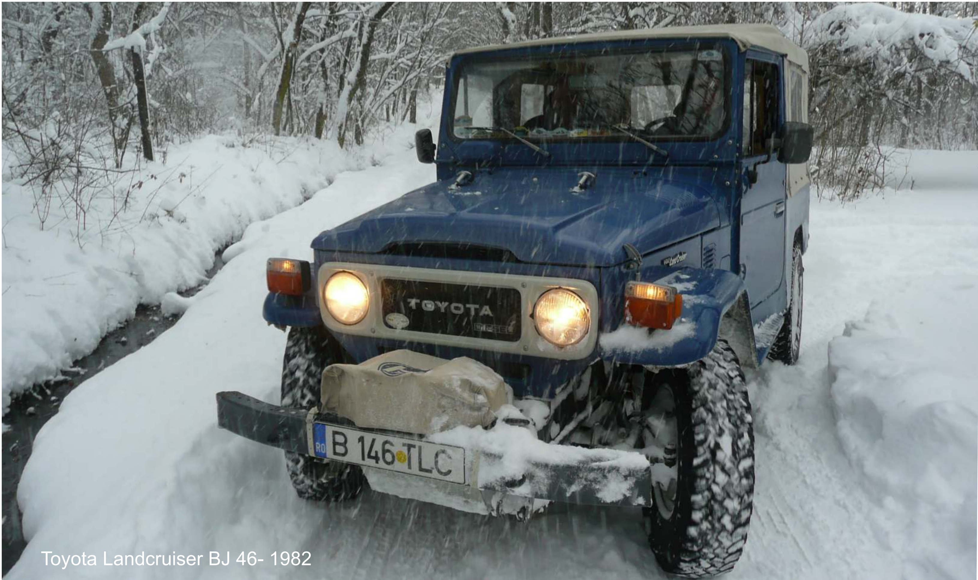
Toyota Landcruiser BJ 46- 1982