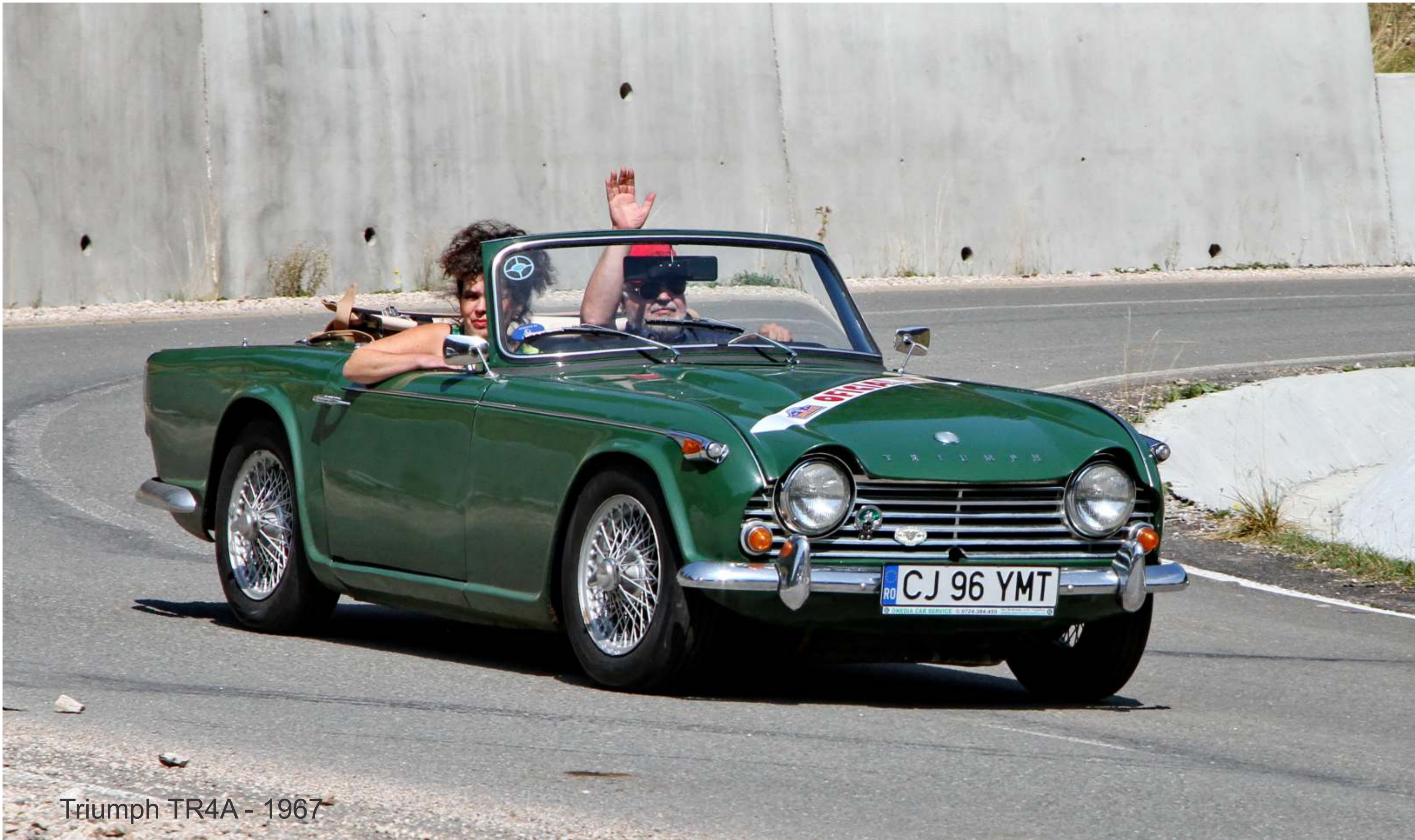
Triumph TR4A - 1967